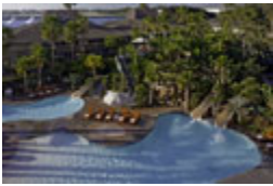
Hyatt Regency Mission Bay

One Monarch Beach Resort Dana Point, CA 92629 (949) 234 3200