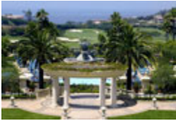
The St. Regis Monarch Beach

21100 Pacific Coast Highway Huntington Beach, CA 92648 (714) 845 8000