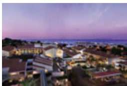
Portola Hotel and Spa